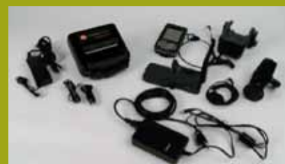
Accessories used in a typical application involving a separate printer and mobile computer.