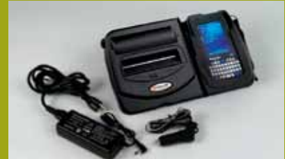
Accessories used to charge both the PrintPAD and mobile computer

No hidden cost - Another way to keep cost down is to look for hidden cost. Unlike some other products on the market, the PrintPAD batteries are included in the purchase price. And when its time to replace them, the PrintPAD uses economical replacement batteries. This can add up to big savings for your company.